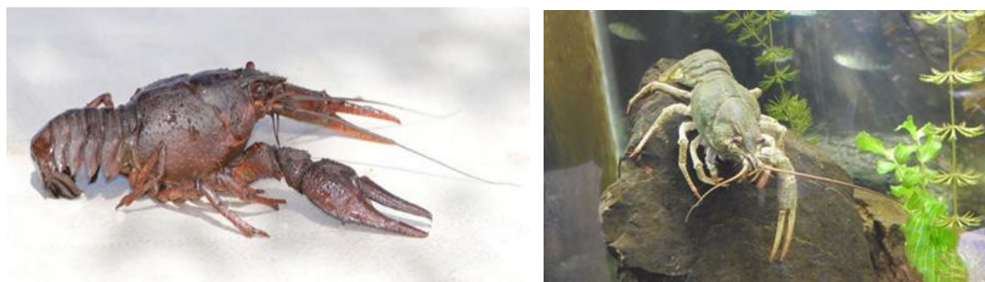
Figure-1. Narrow-toed crayfish ( Pontastacus Leptodactylus )

The article presents information about the extraction of chitin and chitosan from the narrow-toed crayfish ( Pontastacus Leptodactylus ), which lives in rivers, lakes and freshwater reservoirs of Uzbekistan, and its properties.